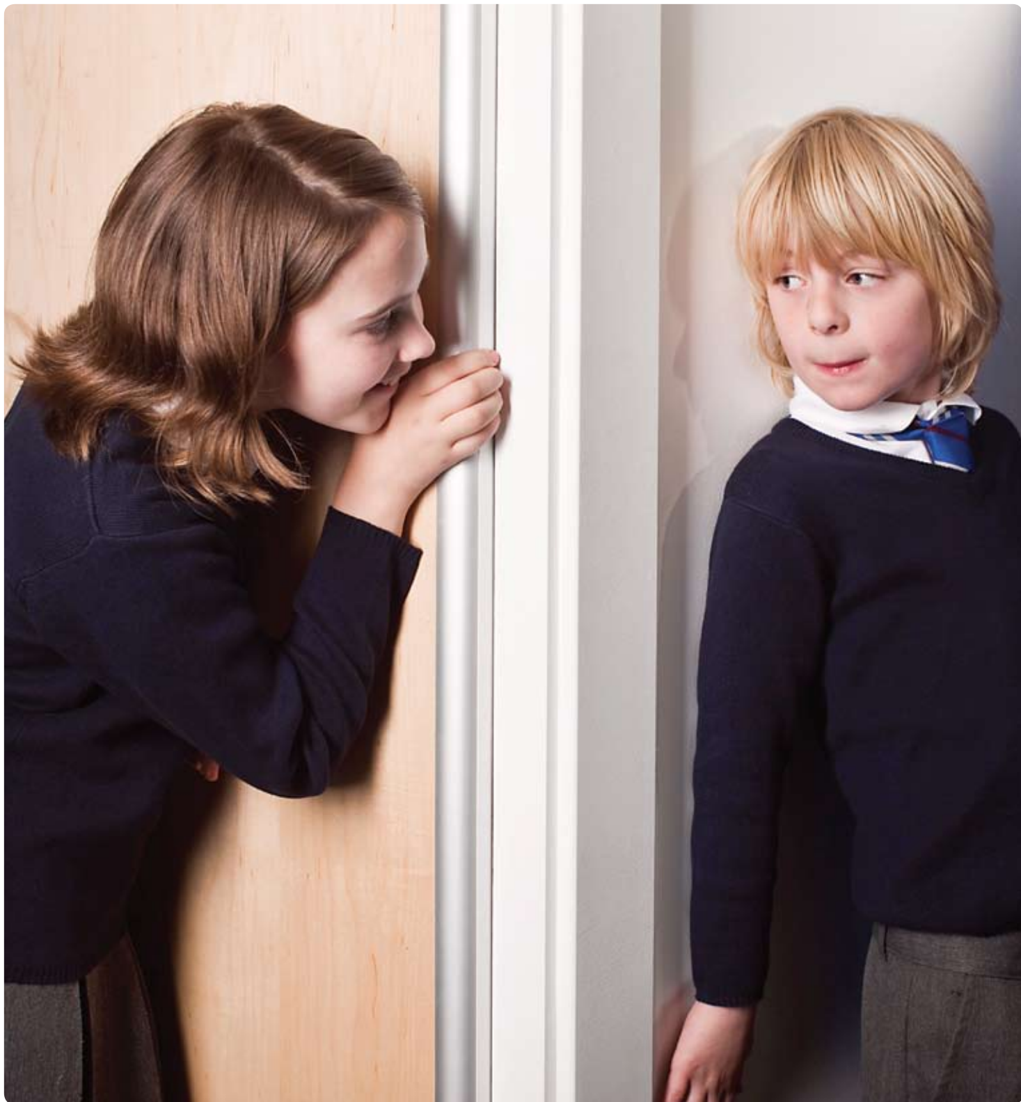
Safehinge ALU Range - Integrated Finger Protection for Doors