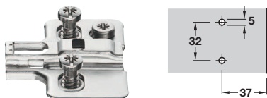
With pre-mounted Euro screws