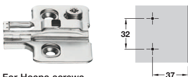
For Hospa screws