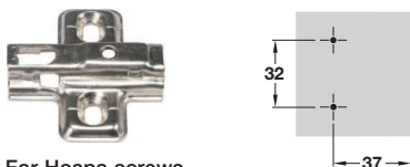
For Hospa screws