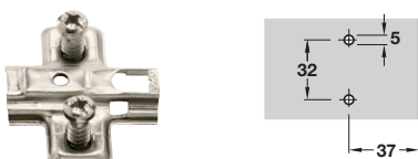
With pre-mounted Euro screws